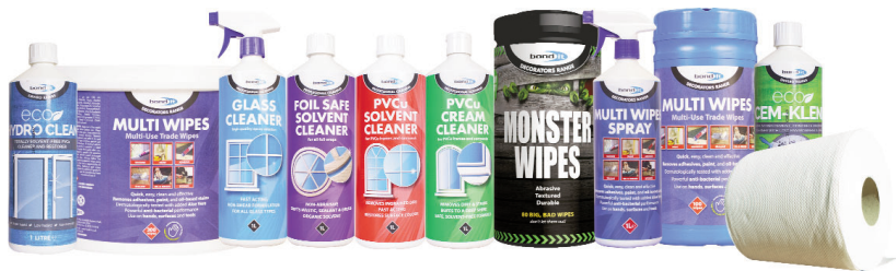
Part of the Bond It Professional Cleaning Range

The data presented in this leaflet are in accordance with the present state of our knowledge, but do not absolve the user from carefully checking all supplies immediately on receipt. We reserve the right to alter product constants within the scope of technical progress or new developments. The recommendations made in this leaflet should be checked by preliminary trials because of conditions during processing over which we have no control, especially where other companies raw materials are also being used. The recommendations do not absolve the user from the obligation of investigating the possibility of infringement of third parties rights and, if necessary clarifying the position. Recommendations for use do not constitute a warranty, either expressed or implied, of the fitness or suitability of the products for a particular purpose.