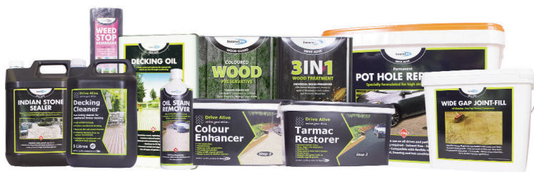
Part of the Bond It Drive Alive Range

The data presented in this leaflet are in accordance with the present state of our knowledge, but do not absolve the user from carefully checking all supplies immediately on receipt. We reserve the right to alter product constants within the scope of technical progress or new developments. The recommendations made in this leaflet should be checked by preliminary trials because of conditions during processing over which we have no control, especially where other companies raw materials are also being used. The recommendations do not absolve the user from the obligation of investigating the possibility of infringement of third parties rights and, if necessary clarifying the position.