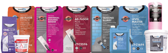
Part of the Bond It LevelMaster Range